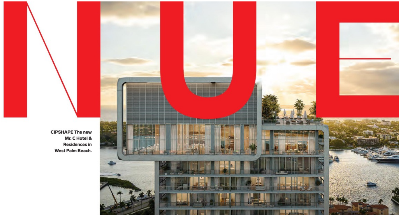
The new Mr. C Hotel & Residences in West Palm Beach.