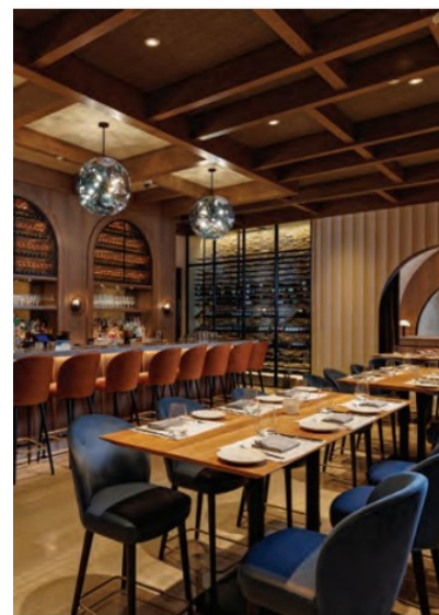
Above: The dining room at Paranza.

Palm Beach is a booming foodie destination. Our restaurant critic takes a bite. BY BETH LANDMAN